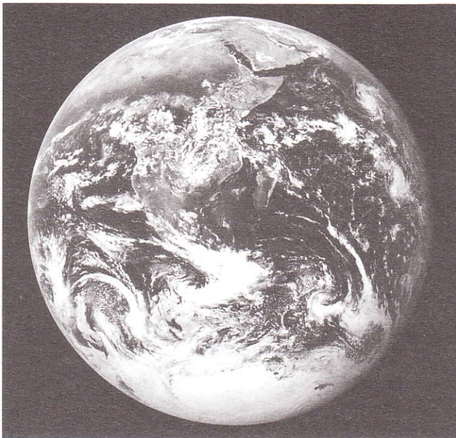
Apollo 17 Whole Earth View: This view of the Earth was seen by the Apollo 17 crew as they traveled toward the moon on their NASA lunar landing mission. This outstanding translunar coast photograph, was taken with a 70mm handheld Hasselblad camera equipped with a 80mm lens.