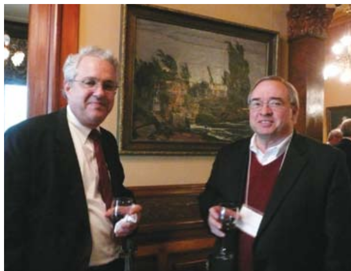
TMS members enjoy an informal buffet dinner at the Littlefield House.