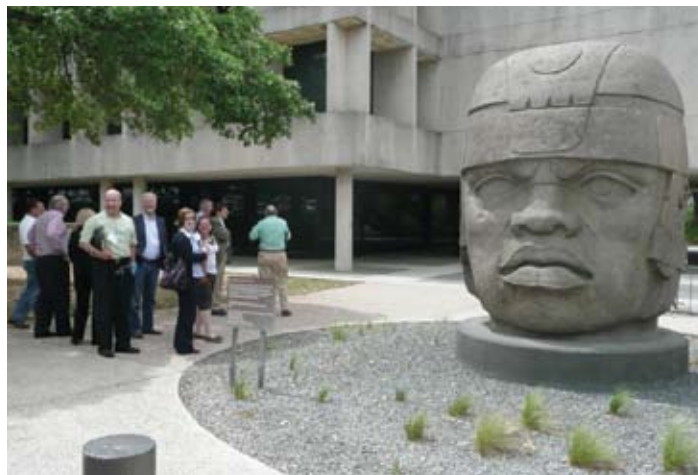
TMS members arrive at the Nettie Lee Benson Latin American Collection.