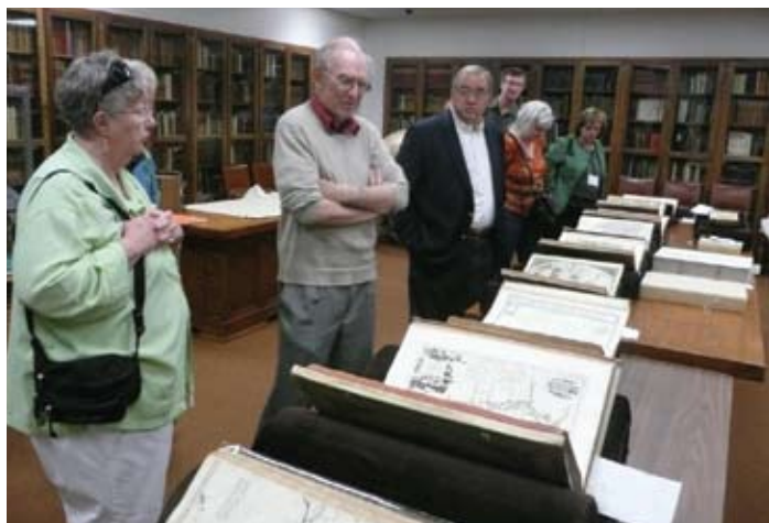
Atlases on display at the Harry Ransom Humanities Research Center.