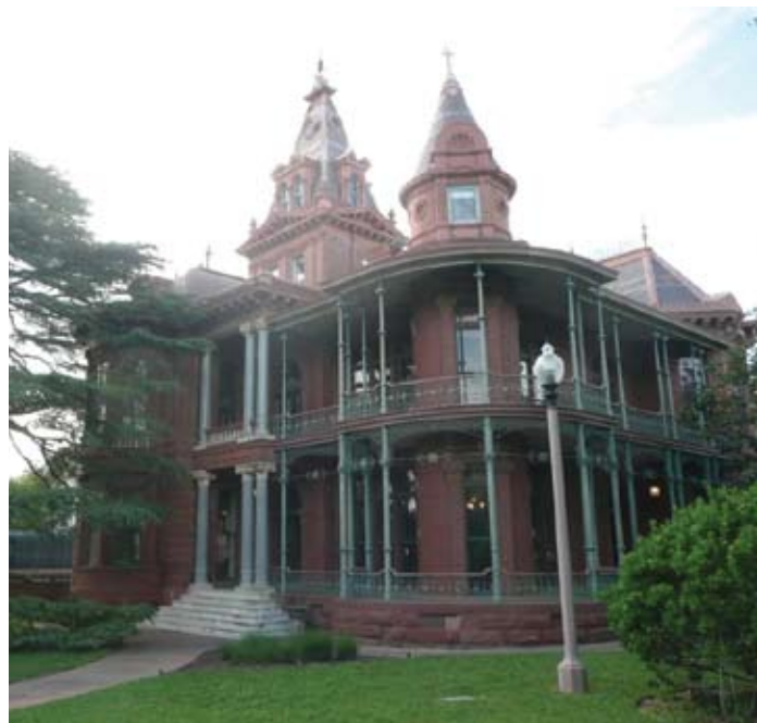
Exterior of the historic George W. Littlefield House.

The day concluded with an informal buffet dinner at the historic George W. Littlefield House on the campus of the University of Texas.