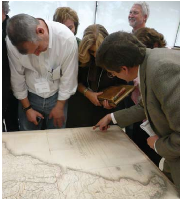
TMS members examine a huge map of South America at the Benson Collection.

Dr. Hironymous displayed a varied and interesting selection of the Relaciones Geográficas , providing a vibrant depiction of the villages they portray and the period in which they were crafted. Some of the villages are portrayed in a clearly Spanish style, showing villages with lush green hills and lakes. Other maps, drawn in a predominantly indigenous style, use symbols along a circular path to depict the attributes of the village, and incorporate the traditional drawing of shells on a river's border. For a glimpse of the Relaciones Geográficas Collection go to: http://www.lib.utexas.edu/benson/rg/ ; a few of the other early maps can be seen at http://www.lib.utexas.edu/benson/historicmaps/ .