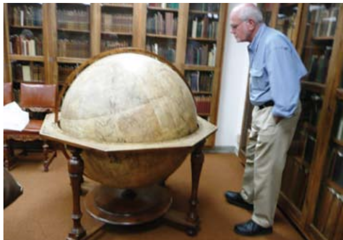
Part of the spectacular Map and Globe Collection at the Ransom Center.