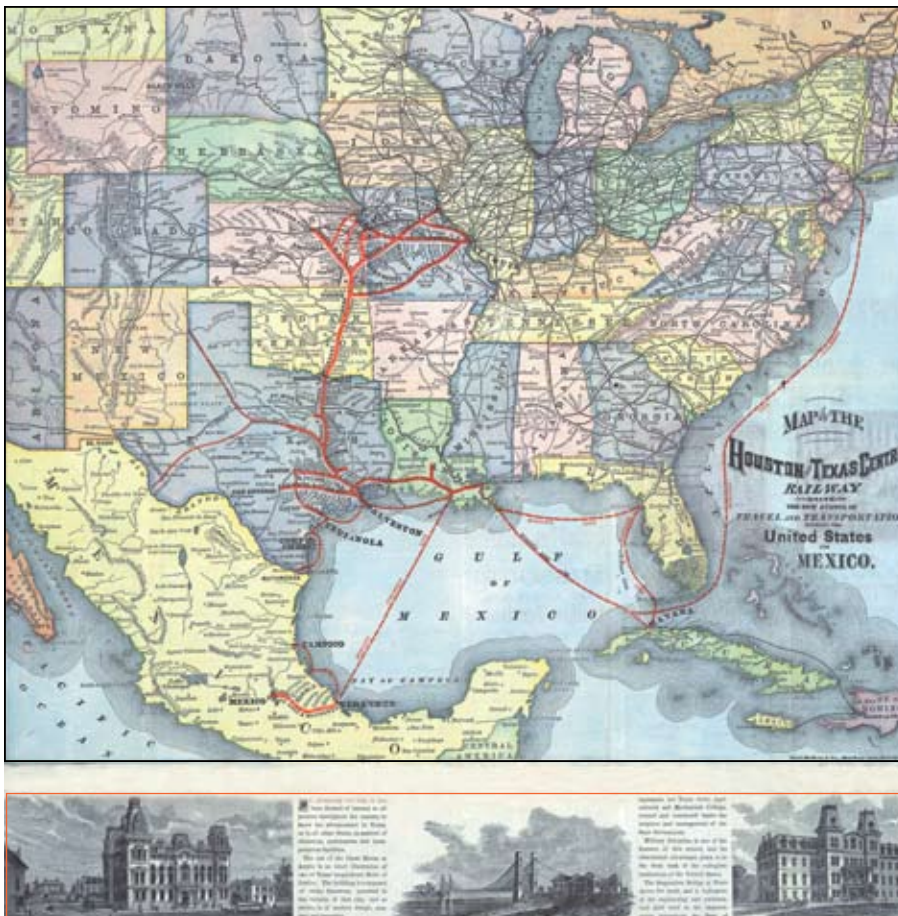
A chartered railroad company map from the exhibit: Map of the Houston and Texas Central Railway. The New Avenue of Travel and Transportation Between the United States and Mexico , Color cerograph (relief line engraving), 50 x 50 cm., folds to brochure, 21 x 9 cm., has timetable on back. (Chicago: Printed by Rand, McNally and Company for the H.&T.C.Railway, 1880). UT Arlington Library Special Collections.