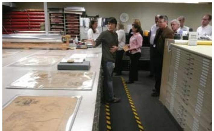
Map Storage area at the General Land Office.