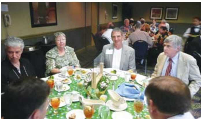
TMS members enjoy their buffet lunch between sessions.