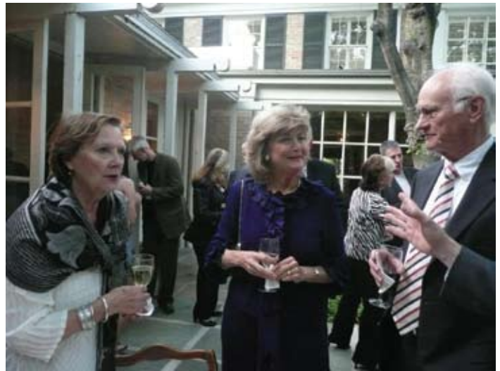
TMS members enjoy a reception on the patio at the Tarry House.

More details on the session can be found in the Conservation Corner article below.