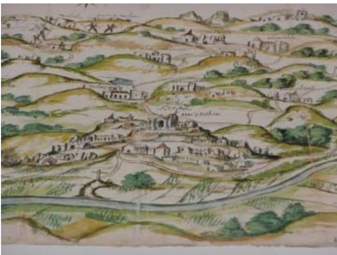
One of the many fascinating maps in the Relaciones Geográficas collection.