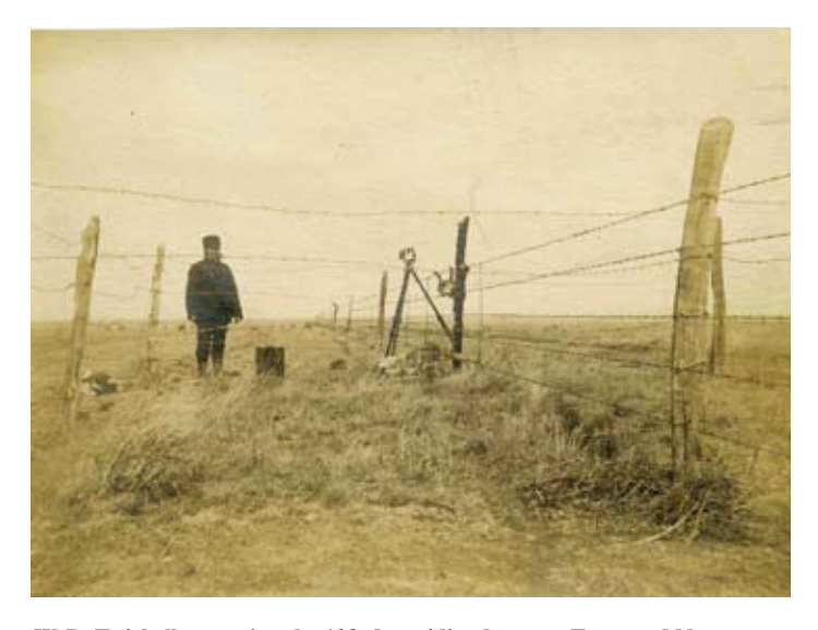
W. D. Twichell surveying the 103rd meridian between Texas and New Mexico, 1903. Note the box to Twichell's side containing his surveying equipment, and the solar compass on a tripod that stands over the surveying monument (piled rocks) being documented by the photo. A closer look reveals a stack of wolf hides on the ground and an antelope skull on the fencepost.