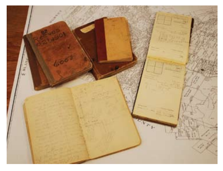
Examples of field books found in the Twichell Survey Records. Field books—the notebooks that surveyors make on the ground—are particularly valuable as they contain sketches, computations, and notes from which official field notes and maps are created.