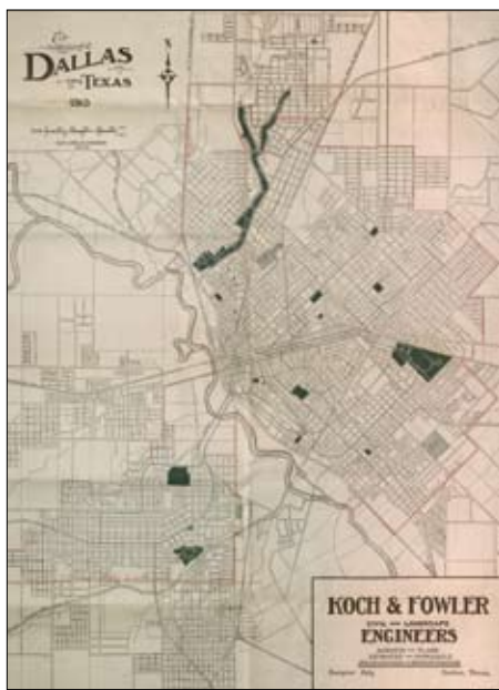
Koch & Fowler, Civil and Landscape Engineers, Dallas, Texas, 1915, photolithograph, 53 x 40 cm. (Dallas: Koch & Fowler, 1915)