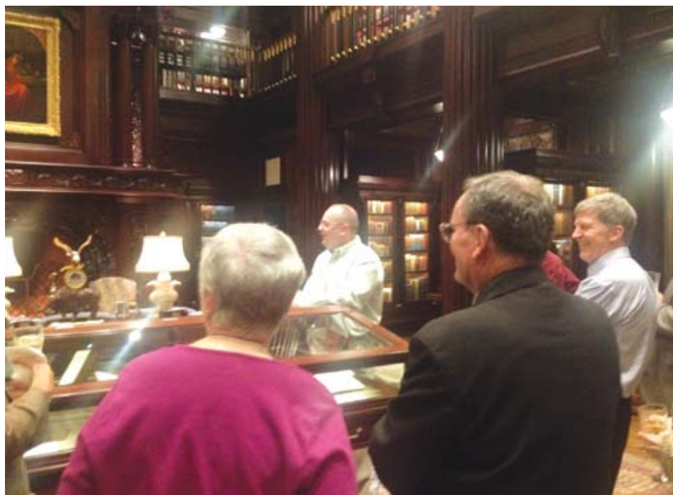
TMS members gather to enjoy the reception and tour of the Harlan Crow library.