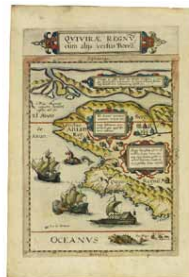
Cornelis De Jode, Qvivirae Regnv, cum alijs verfus Borea (Antwerp, 1593). Digitized map at the General Land Office in Austin, TX, from the Holcomb Map Collection. GLO Map #93833.