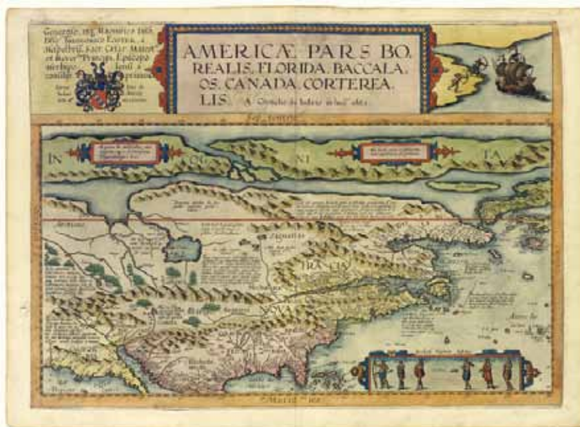
Cornelis De Jode, Americae Pars Borealis, Florida, Baccalaos, Canada, Corterealis , (Antwerp, 1593). Digitized map at the General Land Office in Austin, TX, from the Holcomb Map Collection. GLO Map #93832.