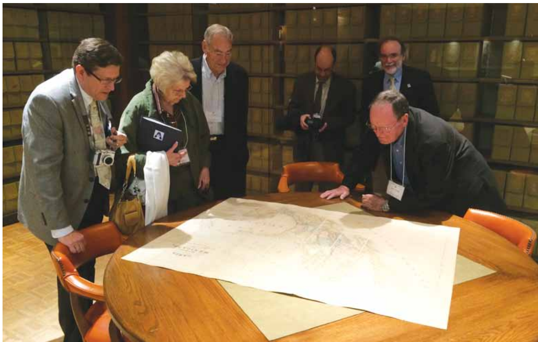
TMS members gather to examine maps in UTA's Special Collections.